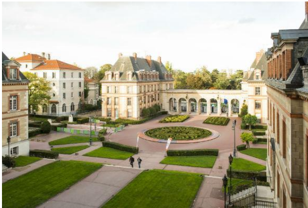
The Campus of the Cité Internationale