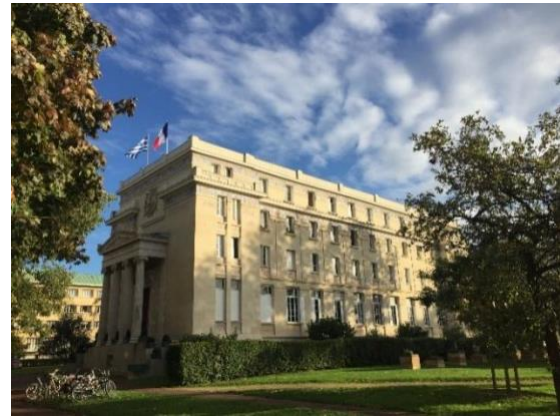
The building of the Fondation Hellénique